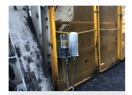
Industry: Quarrying industry Application: Belt conveyor