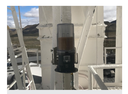
Industry: Quarrying industry Application: Shaker screen