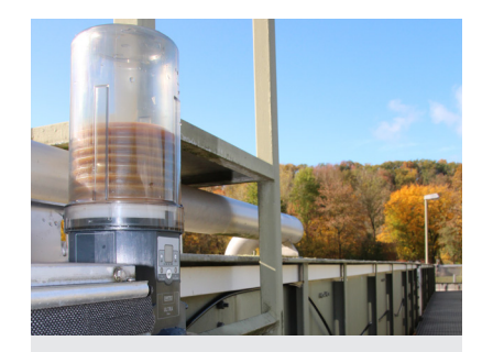
Industry: Sewage treatment plants Application: Rotary screen